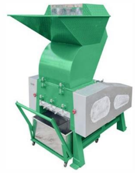
MS-H30 Heavy-duty Multipurpose Shredder