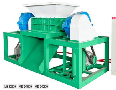
MS-D800 MS-D1000 MS-D1200