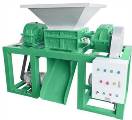
MS-D400 Double Shaft Multipurpose Shredder