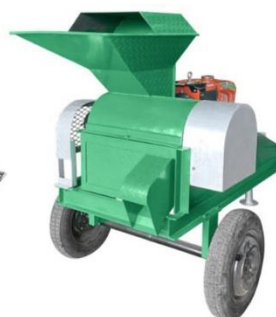
BS-T8 BS-T10 BS-T12