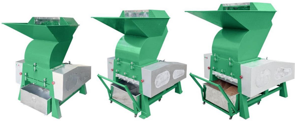
MS-H20 MS-H30 MS-H40 MS-H50

Manufacturer and Supplier of Machines for Material Recovery Facilities (MRF)