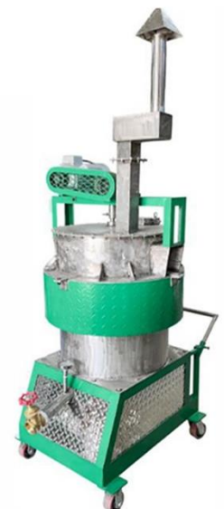
PM-1 Plastic Melter / Densifier