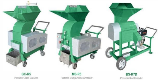
GC-R5 Portable Glass Crusher MS-R5 Portable Multipurpose Shredder BS-R7D Portable Bio-Shredder

Manufacturer and Supplier of Machines for Material Recovery Facilities (MRF)